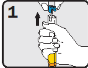
Form fist around EpiPen® and PULL OFF BLUE SAFETY RELEASE